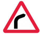
Bend To Right