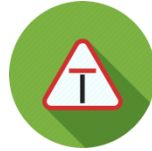
Dead End Street