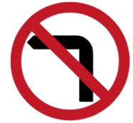
No Left Turn