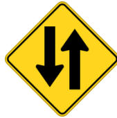
Two-Way Traffic Ahead