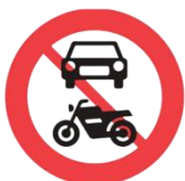
No Motor Vehicles