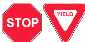
Stop And Yield