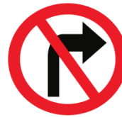
No Right Turn