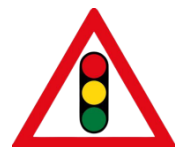
Traffic Signs Ahead