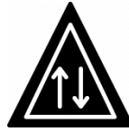
Two Way Traffic