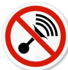
No Blowing Of Horn