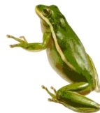
Green Tree Frog