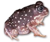
Oregon Spotted Frog