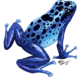
Poison Dart Frog