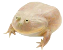
Spade foot Toad