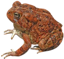
African Tree Toad