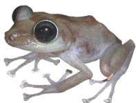
Gray Tree Frog