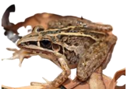
Striped Rocket Frog